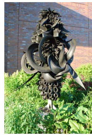
Above: Meeting Ends 2005 rubber tires, stainless steel 80 x 50 x 47 Loan courtesy of the artist

Left: Serendipity 1998 rubber tires, wood, steel Loan courtesy of the artist